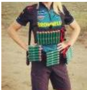
Not Allowed , any configuration that resembling chest rigs (much higher than the waist level almost to the chest).