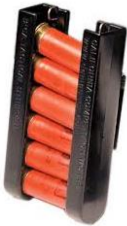
6 in the Caddy is Allowed (Strippers).